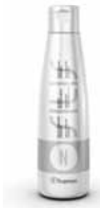
SILIS AQUA-GEL NEUTRALIZING CONDITIONER 150 mL