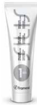
SILIS 1 basic 150 mL for normal hair